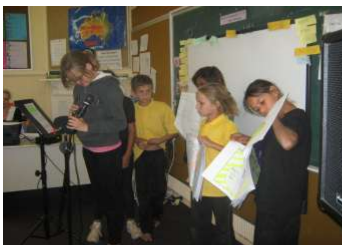
Students presenting items at assembly